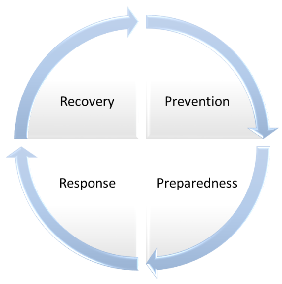
Figure 1: FEMA Model

GHE adheres to the Federal Emergency Management Agency – USA (FEMA) model for emergency and critical incident management which distinguishes between four distinct management phases as outlined in Figure 1 and defined in Table 1.